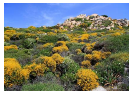
Figure 4. Mediterranean maquis.

Two new vegetated parking areas are planned for a total surface of about 2 hectares. The pavement will be kept permeable with flower beds and edges of endemic shrubs and trees (Mediterranean maquis, see figure 4). These features make the car parking shaded and pervious hence able to mitigate the heat island and increase the water infiltration.