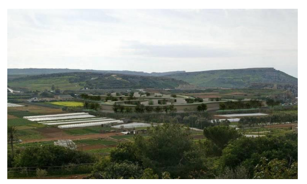
Figure 2. Agricultural areas in the inland area of Ħal Ferħ near Villa Frere. Source: TVM, 2020. Available at: <u>https://www.tvm.com.mt/en/news/church</u> <u>s-environment-commission-does-not-</u> <u>agree-that-land-at-hal-ferh-should-be-</u> used-for-residential-development/.

Key policy goals in the region include the redevelopment of land for tourism purposes (by amending policy NWGT 1 of the North West Local Plan and the Hal-Ferh Development Brief), with the inclusion of high-quality residential accommodation.