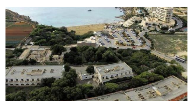
Figure 1. View of the currently unused Hal Ferh complex and the beach front with the Radisson Blu hotel.

Close to the beach, the uses are mainly targeted at tourism, focussed on high-season visitors, but also some year-round activities. Besides