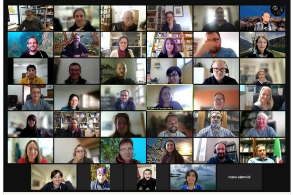
Figure 1. doi Screenshot from one of the Workshop plenary sessions.