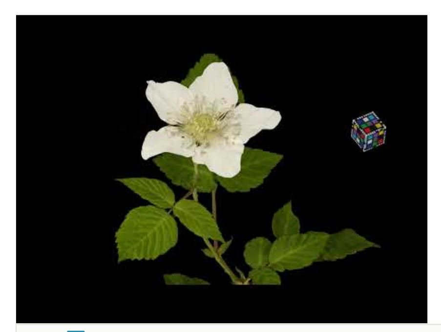
Figure 3. doi

Movie of the 3D model of the hirsute raspberry, Rubus hirsutus . Original data: <u>https://skfb.ly/o9tQ9</u> or <u>https://floraZia.com/f/2353</u>.