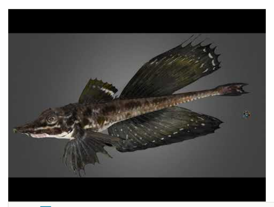
Figure 1. doi

Movie of the 3D model of the sailfin poacher, Podothecus sachi . Original data: <u>https://skfb.ly/otRSM</u> or <u>https://fish.asia/f/84092</u>. The embedded cube with a color chart indicates 10 mm and is scaled according to the real object. The object colour is not standardised (the colour chart is just a rough indication).