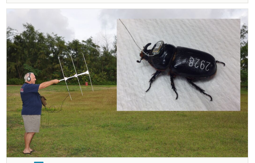
Figure 2. doi Miniaturised radio transmitter tag attached to the thorax of a coconut rhinoceros beetle. A radio receiver and yagi antenna are used for locating the tag.