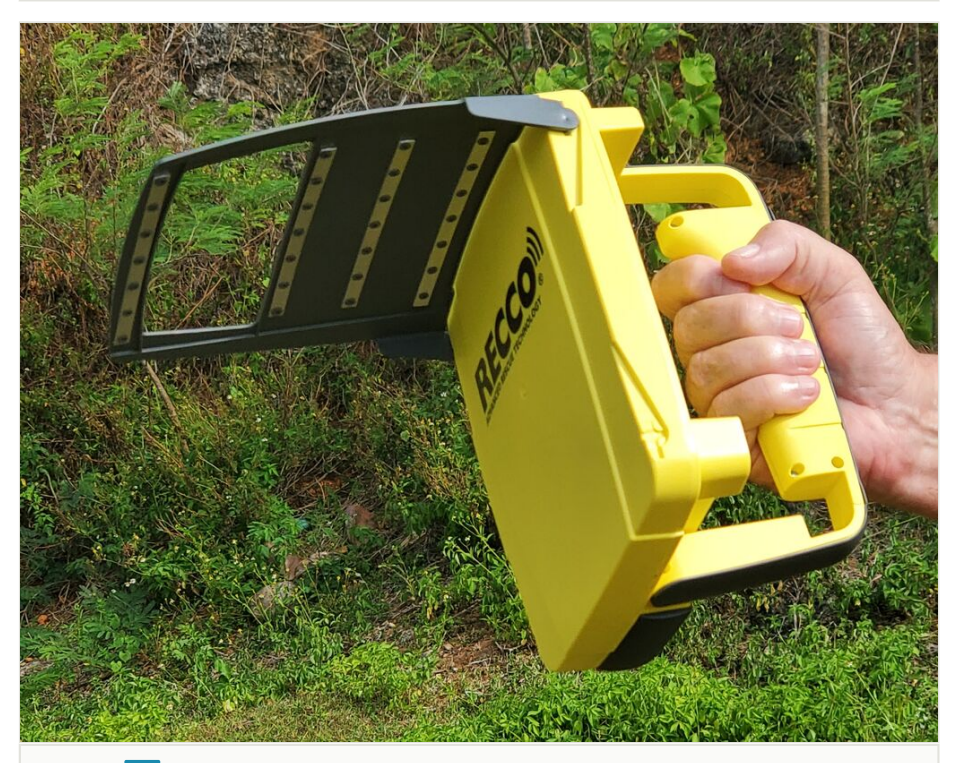
Figure 4. doi RECCO hand-held harmonic radar transceiver.