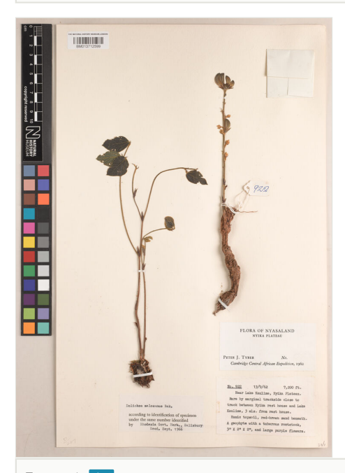
Figure 4. doi

Specimen BM013712599 Dolichos kilimandscharicus var. kilimandscharicus.