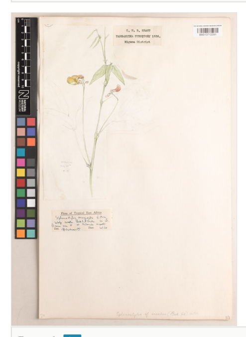
Figure 6. doi

Specimen BM013712091 - Sphenostylis marginata subsp. erecta (Baker f.) Verdc.