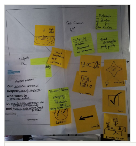
Figure 2. doi Culminating Output: Advocacy Campaign.

This solution aims to create a ripple effect of organizations that think globally while acting locally. It uses expert opinions, articles, examples and 'celebrity' endorsements to demystify the "metadata" space and its benefits, thereby building trust and increasing research impact and reach (Fig. 2).