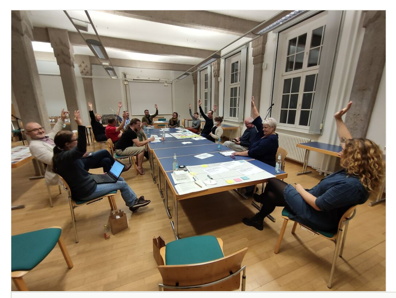
Figure 3. doi Flashlight at the end of the DF transfer workshop; photo: Torsten Görg.

with a presentation of DF, followed by small group discussions to explore the motivations and potential strategies for embedding DF and concluded with a brief exchange to share the participants' reflections (see Fig. 3). In contrast, SLS wanted a workshop which fostered formal and informal exchange between interregional participants from politics, public administration and school communities. The aim was to create a lively discussion on methods of co-designing schoolyards in a participatory manner. The workshop took the form of a moderated panel discussion with two mayors in the town hall, on-site excursions to different co-designed schoolyards, an input session on experiences with the co-design of schoolyards in Berlin and a group discussion (see Fig. 4).