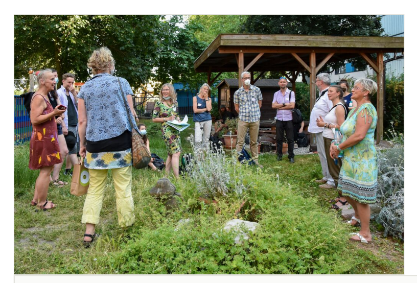
Figure 4. doi On-site excursion during the SLS transfer workshop; photo: Nicole Herzog.

On-site excursions can help promote a better understanding of the project and make its results visible and tangible, especially for projects where physical-material structures are changed (as was the case with SLS); they also make it easier for everybody to join the conversation and express their perceptions.