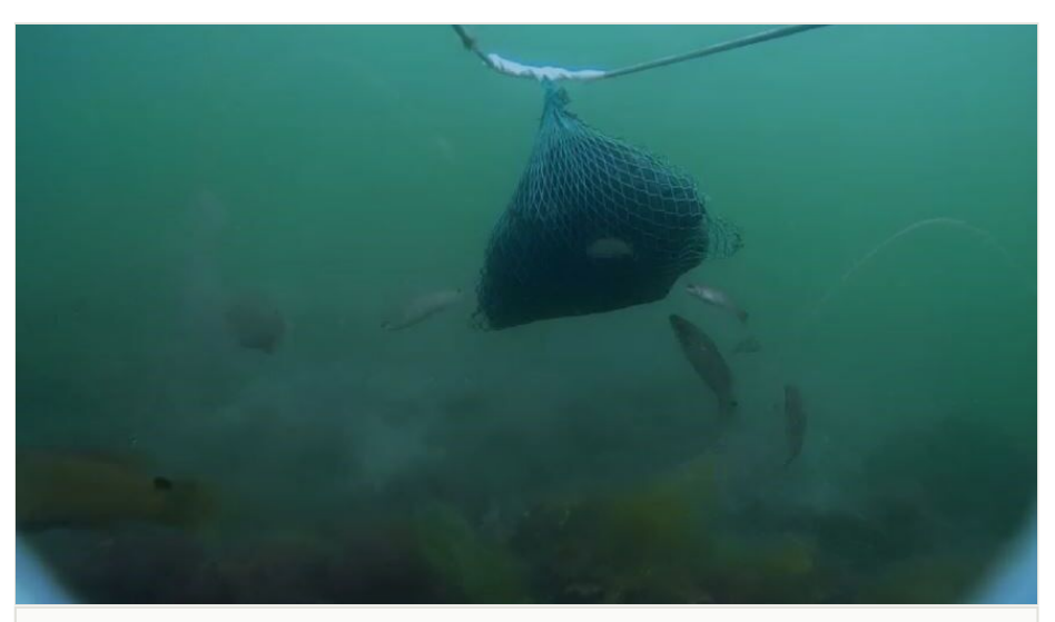
Figure 4. doi

AquaticVID was used in a Swedish BRUVS bait comparison study to evaluate the number of fish attracted to various bait types, with deployments lasting up to 36 hours of continuous filming (Königson and Strömberg 2018, Königson and Hedgärde 2023).