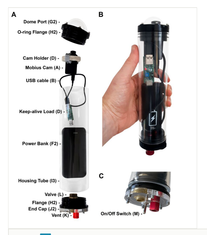
Figure 1. doi

MobiusActionCam (2017) for recording instructions). Mobius provides a windows application with a simple graphical user <a href="interface">interface</a> for adjusting the camera settings. Alternatively, users can use a text file to enter settings (MobiusActionCam 2017). Camera settings and setup are available via the Mobius <a href="manual">manual</a>. Note that, while the cameras are reported to have good sound recording capabilities, we disable the sound function primarily to maximise battery life when recording video and because we do not generally require sound data in our camera-based studies. As a result, we have not field-tested sound recording or sought to optimise sound recording in the AquaticVID systems.